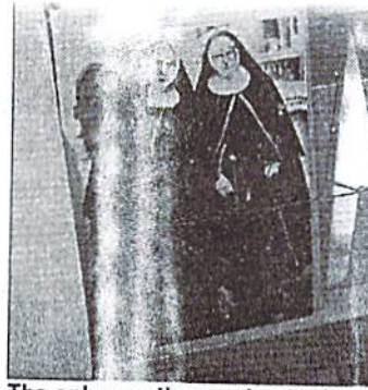
The only greeting card not ruined in the crash featured two nuns on the front.

Concerned that something might be wrong with the reverse gear in her 2007 Honda CRV, Oates said she put the car in drive with the intention of pulling back into the parking spot to figure out what was wrong. It was then that she said the car lurched forward, with the engine continuing to